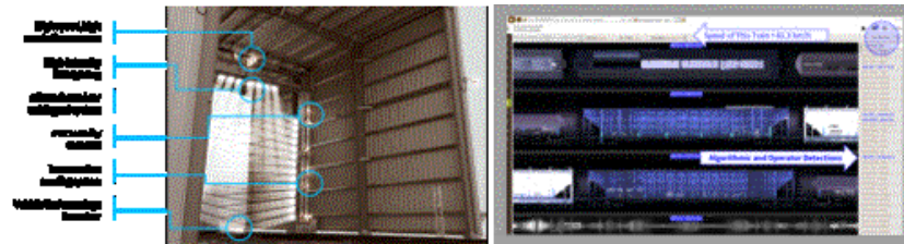
Rail Inspection Portal rip® - Canadian Location Operator Interface - centraco®

Our rip® system consists of a suite of sub-systems for the automated inspection of freight or transit railcars at high speeds. The combined technologies capture images and other relevant operating data from 360-degrees of each locomotive and railcar passing through our inspection portal. All data is processed and presented in real-time by our proprietary intelligent user interface, branded as centraco® .